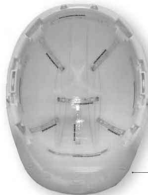
10 RFID STICKERS APPLIED TO HARD HAT