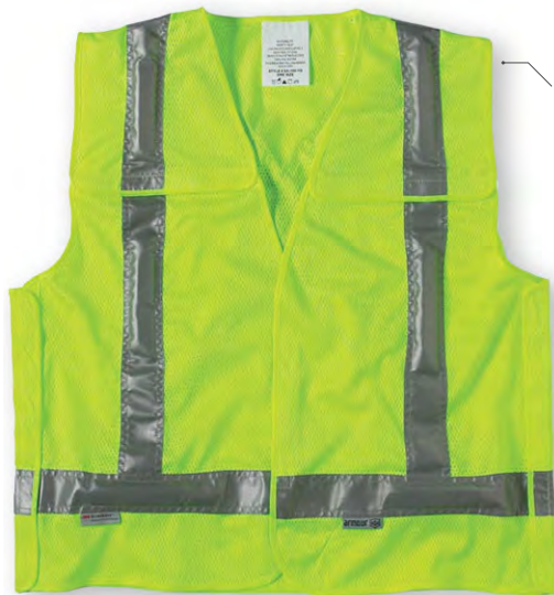
CLASS II HI-VIS YELLOW SAFETY VEST